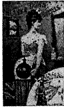
Alaska Down Original Paper Collage ( Graffiti Series ) 36 "x 24" (framed), 2011