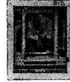
Her Scales of Fate Mixed Media Diorama 15.5 "x 12"x 4.5, 2000