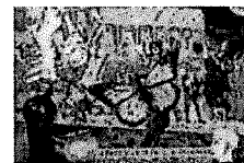
Prodigies Original Paper Collage 27 "x 37", 2012