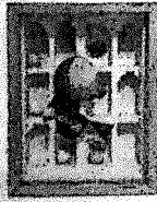
Ignus Electrici Mixed Media Diorama 15.5 "x 11"x 4.5, 1964