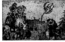
Untitled (Oculus) Original Paper Collage 19 "x 25.75", 2012