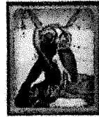
Herr Stork Arrives Mixed Media Diorama 22 "x 18"x 3.5, 2003