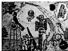
Hazards of Vision (Graffiti Series) Original Paper Collage 30.5 "x 39" (framed), 2011