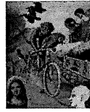
A Heavenly Time Original Paper Collage 34 "x 28.5", 2012