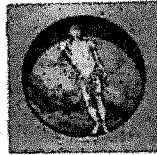
White Light of Love Mixed Media Diorama 16.5 "x 16.5"x 4", 2001