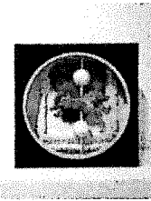
Banners Of The Night - Rocking Horse Winner ( To D.H. Lawrence ) Mixed Media Diorama 16.5 "x 16.5"x 4", 2000