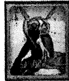
Herr Stork Arrives Mixed Media Diorama 22 "x 18"x 3.5, 2003