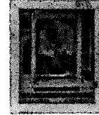
Her Scales of Fate Mixed Media Diorama 15.5 "x 12"x 4.5, 2000