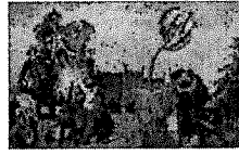
Untitled (Oculus) Original Paper Collage 19 "x 25.75", 2012