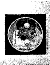
Banners Of The Night - Rocking Horse Winner ( To D.H. Lawrence ) Mixed Media Diorama 16.5 "x 16.5"x 4", 2000