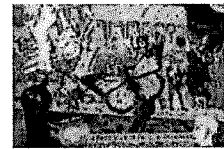
Prodigies Original Paper Collage 27 "x 37", 2012